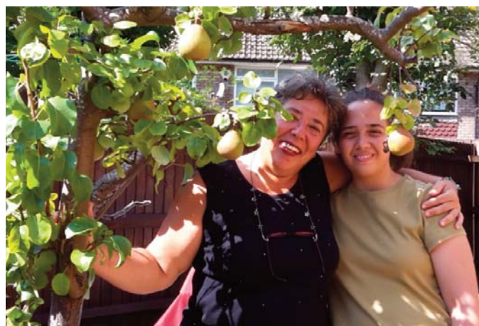
Banu's Turkish Breakfast, page 02