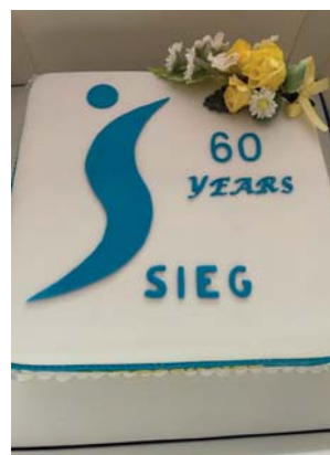
Sixty glorious years, page 05