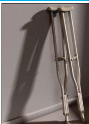
Crutches for Ukraine, page 07