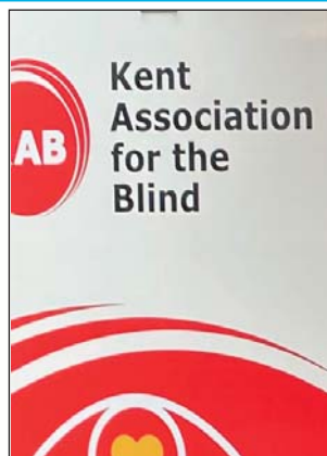
Thanks to Talking News Volunteers, page 03