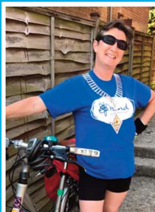
A tribute to Grace, page 08