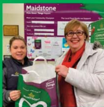
Donated gifts from Morrisons