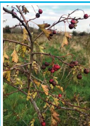
Eastbourne's Tree Planting Project page 04.