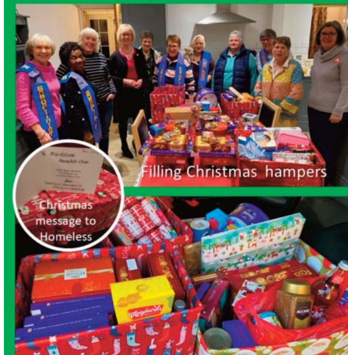
Filling Christmas hampers