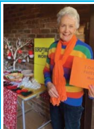
Final day of 'Orange the World' page 02.