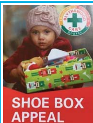
Boxes loaded and on way to Romania, page 05.