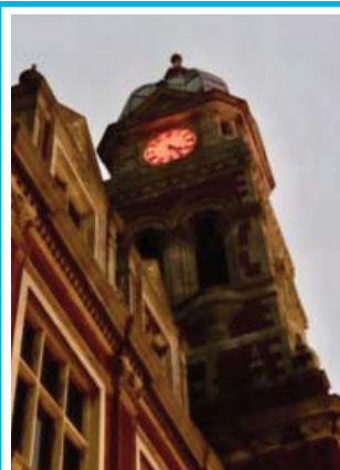
Orange Town Hall clock to support vigil, page 02.