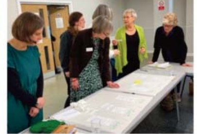
Stop Start Keep Exercise