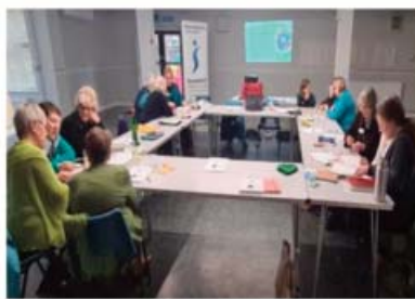
PA impact evaluation exercise