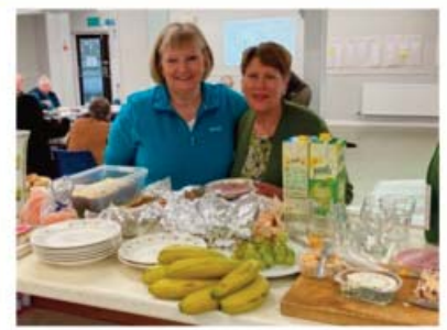
It's time for lunch .....