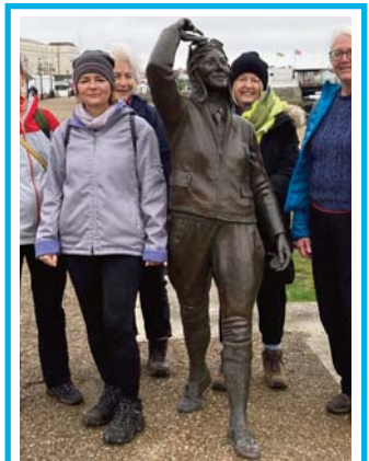
Launch of Whitstable District Club, page 07.