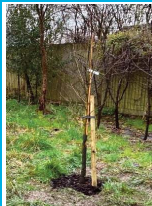
Tree planting to remember Sue, page 02.