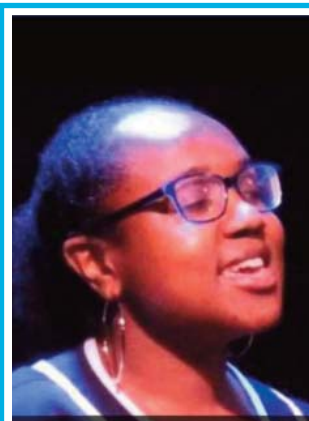
Meet Croydon's Poet Laureate, page 06.