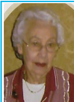
Presentation of Molly Oldham Award, 03.