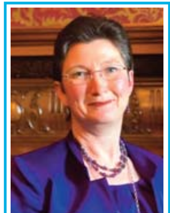
Launch of Grace Onions Award, page 04.