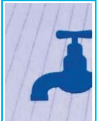
SI Bromley twinned with a tap in Nepal, page 02.