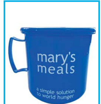
Small Change Can Make A Big Change, page 04.