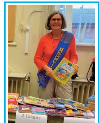
UNICEF book sale at Byron School, page 06.