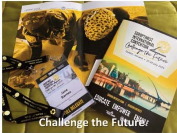
Challenge the Future