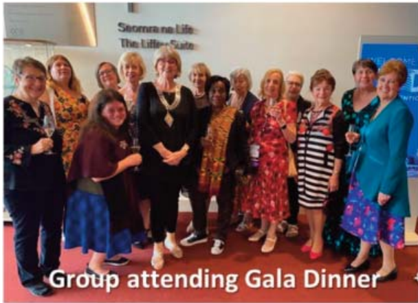
Group attending Gala Dinner