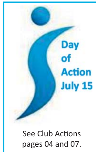
See Club Actions pages 04 and 07.