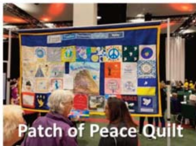
Patch of Peace Quilt