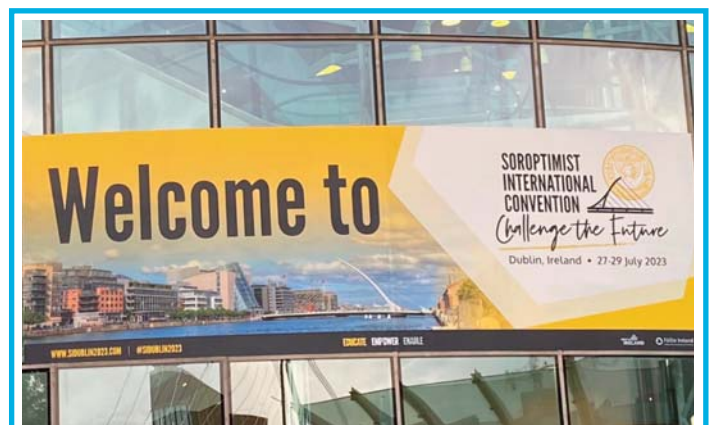
Memories of the Soroptimist International Convention held in Dublin, pages 09 and 10.