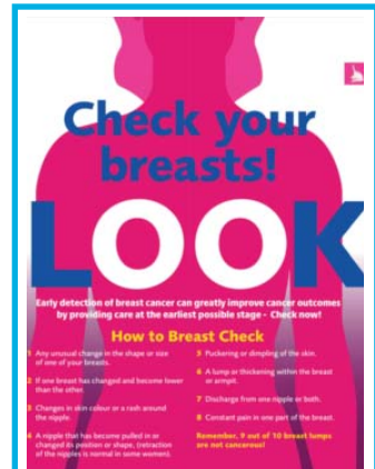
Folkestone club take part in Moonwalk, page 07.