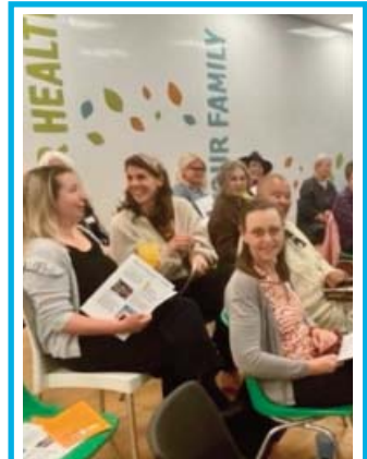
Membership Month, open meeting, page 03.