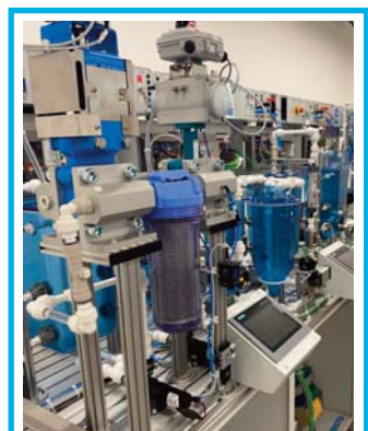
International Day of Women and Girls in Science, page 10.