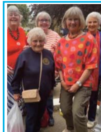
Sevenoaks Club 'Orange the World', 06.