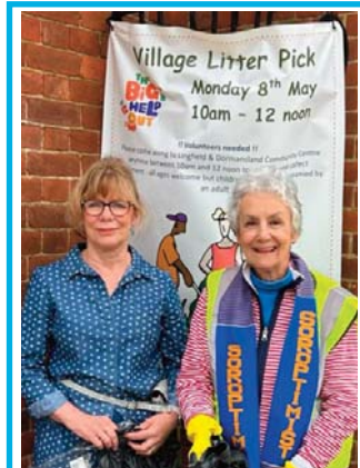
Coronation Big Help Out, page 02.