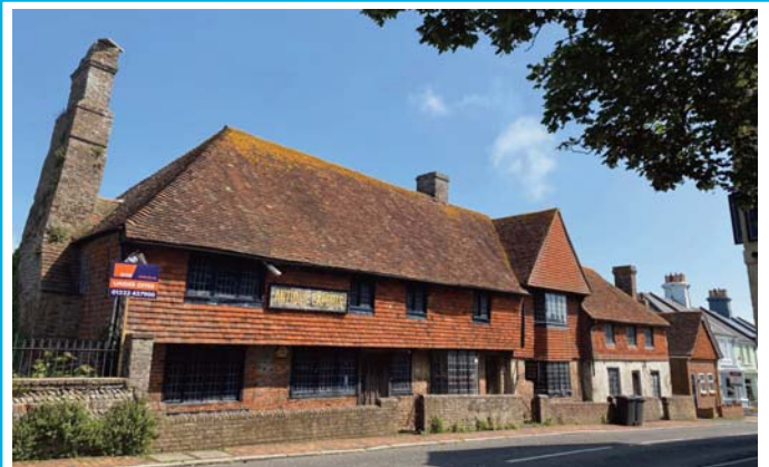
Eastbourne members visit the iconic Mint House at Pevensey, page 02.