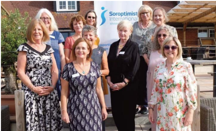
Members of the newly Chartered Club