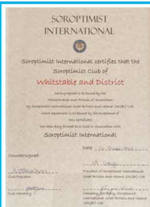
SI Whitstable and District, page 03 and 09.