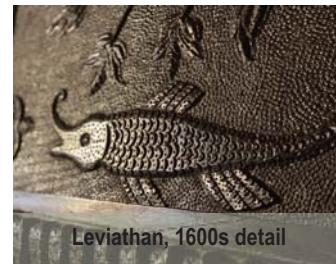
Leviathan, 1600s detail