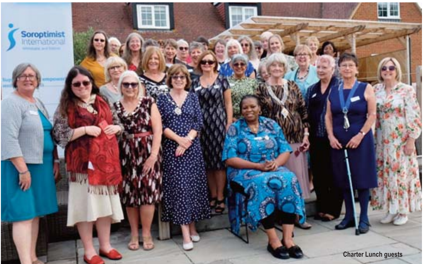
Charter Lunch guests