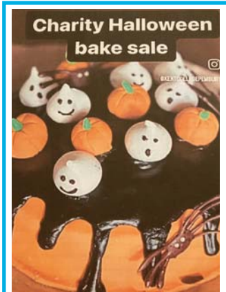
In support of orphanages in South African, page 04.