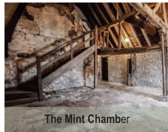
The Mint Chamber