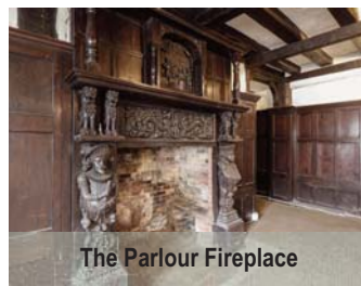
The Parlour Fireplace