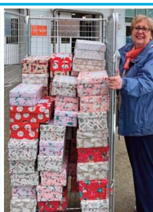
The first batch of shoeboxes, page 07.