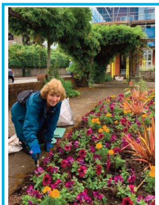
Gold Medal for the Vine Gardens, page 08.