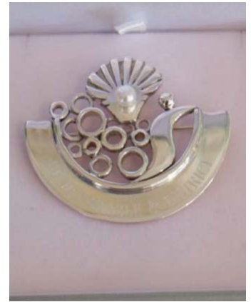
Revealed, the specially designed President's Brooch

The conditions were perfect on October 01 for Chartering the new SI Club for Whitstable and District. It was a lovely, warm day in beautiful surroundings at the Crescent Turner Hotel, overlooking the coastline that is so important to the towns of Whitstable, Faversham and Herne Bay.