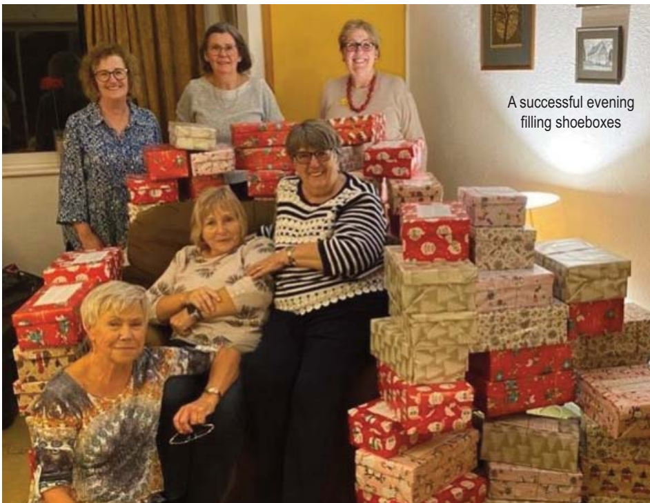
A successful evening filling shoeboxes

SI MEDWAY AND Maidstone meet each year to fill shoe boxes, beautifully wrapped in Christmas paper to give to people in Eastern Europe who face enormous difficulties through poverty, illness, disability etc but whose faces light up with joy when offered a Christmas present.