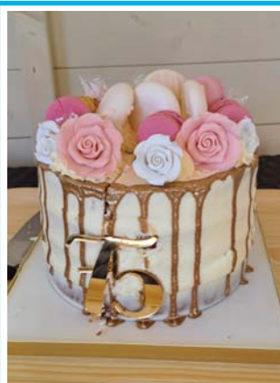
The Rockdale Centre 1948-2023, page 03.