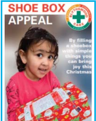
Christmas is fast approaching, page 06.