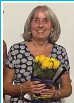
A welcome to seven new members, page 02.