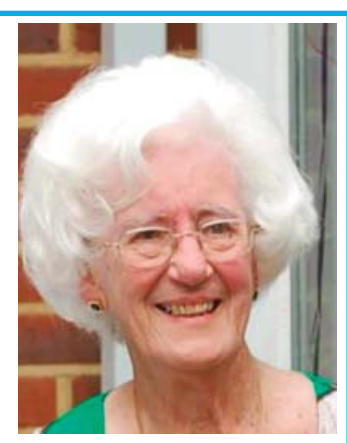
Remembering our Soroptimist Sisters, page 04.