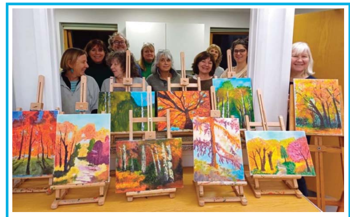
Lewes Club 'Sip and Paint' art workshop, raises funds for the School of Hope, page 02.