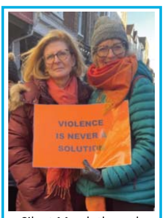
Silent March through Canterbury, page 02.