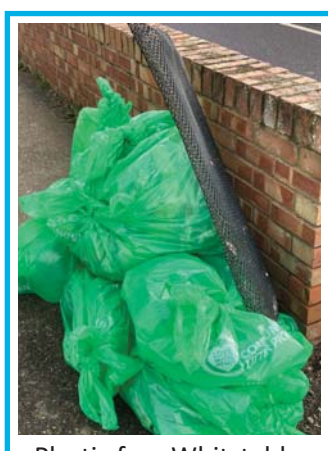
Plastic free Whitstable, page 05.