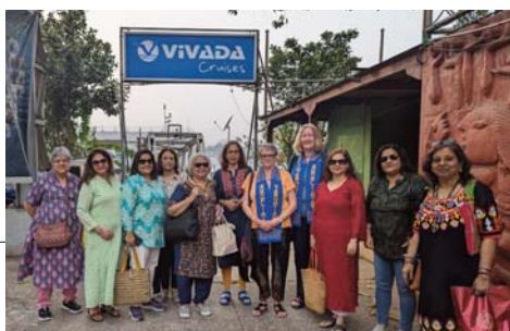
Members of SI Calcutta