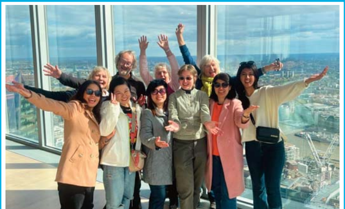
Region hosts visit from Cambodian Soroptimists, seen here on a sightseeing day in London, page 04.