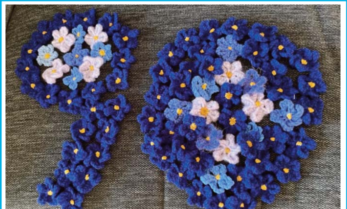
Taking up the challenge to knit 90 Forget-Me-Nots, page 04.