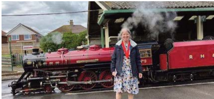
Visit to the Romney Hythe & Dymchurch Railway along with other local mayors for a 'behind the scenes tour' and lunch.