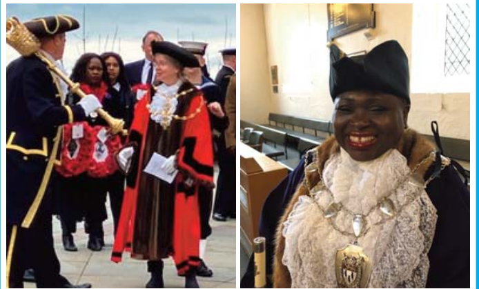
Soroptimists embrace Civic Duties, pages 02 and 03.