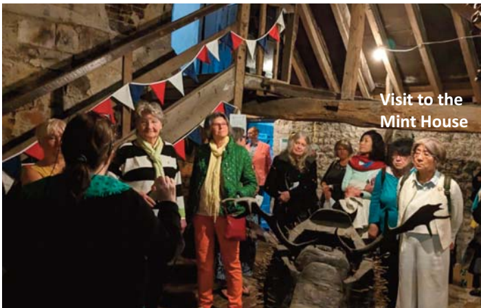
Visit to the Mint House