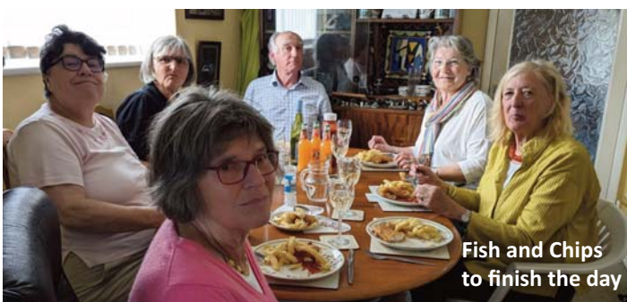
Fish and Chips to finish the day

OUR 70TH ANNIVERSARY celebrations took place during the first weekend in June. We were delighted to welcome our friendship link club visitors; four from Japan, three from Germany and two from Leeds, and they all stayed at Eastbourne's Hydro Hotel where our celebration lunch took place on June 01.