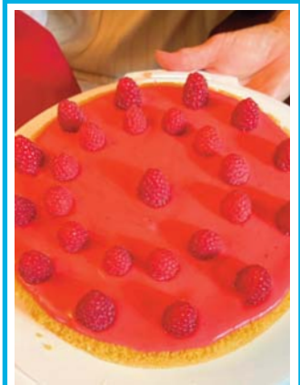
Fundraising Raspberry Tea, page 04.