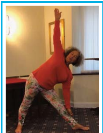
Celebrating Wellness Month, page 06.