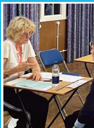
Assisting with Mock Interviews, page 07.