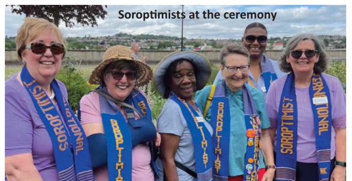
Soroptimists at the ceremony