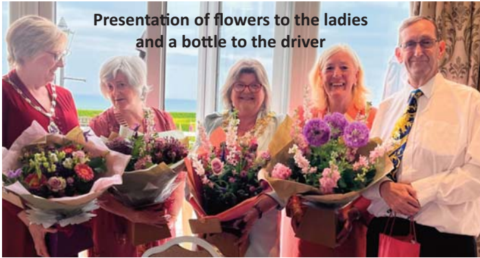
Presentation of flowers to the ladies and a bottle to the driver