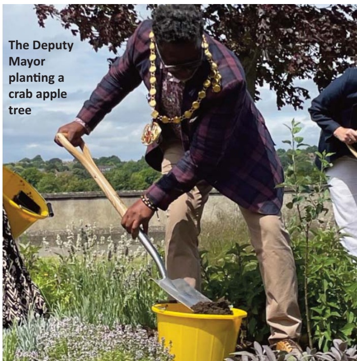
The Deputy Mayor planting a crab apple tree