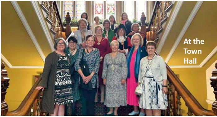
At the Town Hall