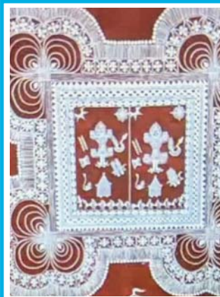
Friendship Link webinars, page 02.