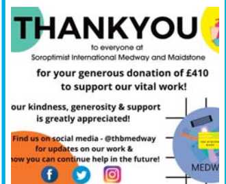
Donation for 50 self-care kits, page 05.