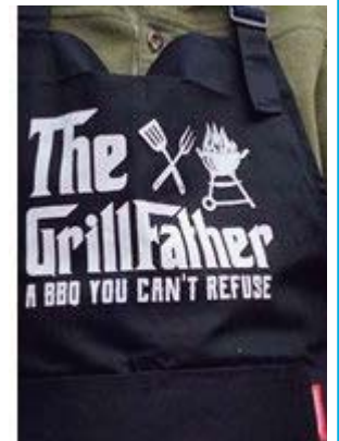
Medway and Maidstone Summer BBQ, page 04.