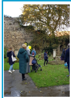
Best Practice Winner P4