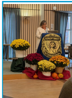
Eastbourne visit to Germany P2