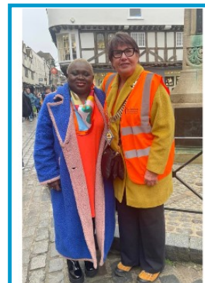
Canterbury's Silent March P8/9