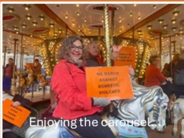
Enjoying the carousel