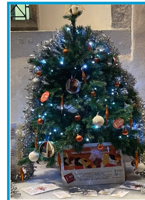
Soroptimist Christmas Tree P6