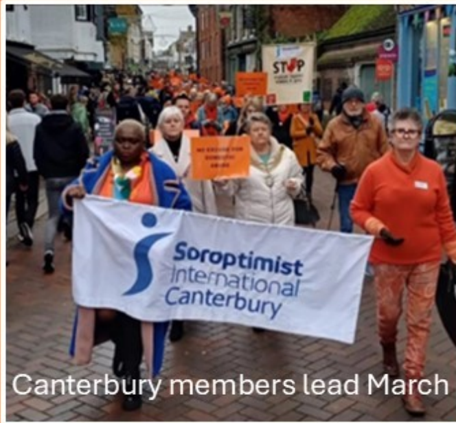
Canterbury members lead March