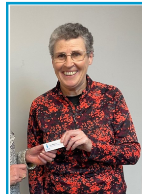
Welcome to new member P5