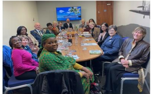
November club meeting