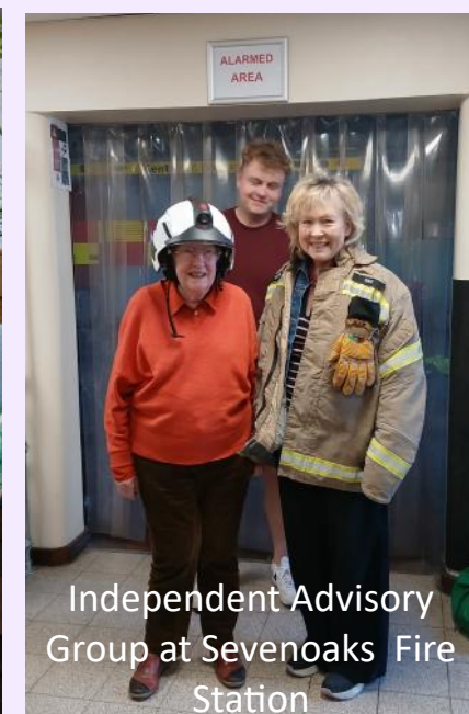
Independent Advisory Group at Sevenoaks Fire Station