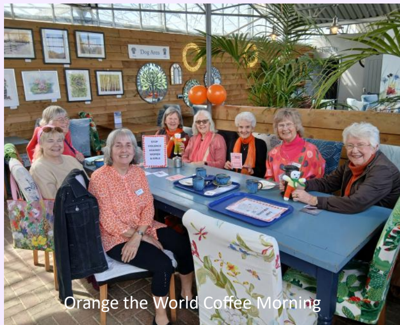
Orange the World Coffee Morning