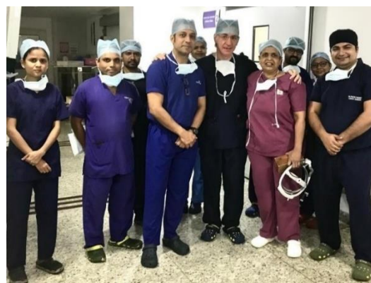
Raipur hospital, homograft team