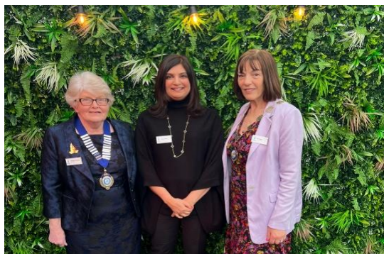
Mother and Daughter (Clubs) send child off to the UN!

The Commission on the Status of Women 2023 (CSW67) will take place from 6 – 17 March 2023 at the United Nations Headquarters in New York and I am beyond honoured to be selected as one of the SIGBI representatives.