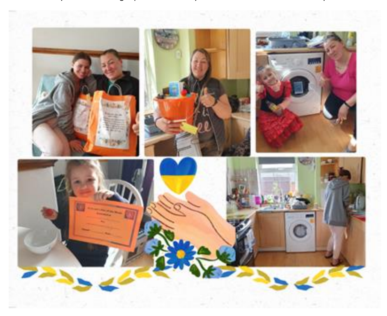
Contributed by Linda Spakouskas

This story sounds straightforward but in truth it was difficult for both families at times, but we have become bonded in a way we never thought possible and they have become our Ukrainian family.