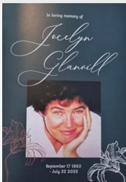
SI SOUTHPORT PAY TRIBUTE TO A MUCH-LOVED SISTER page 19