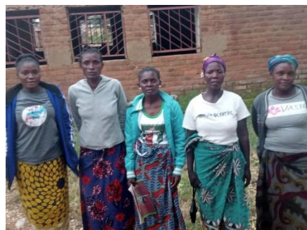
Chimphondwe 0206 Group for farming of groundnuts (Groups are jointly responsible for repayments)

Next time I plan to choose an entrepreneur and tell more of her story.