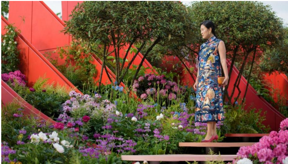
The Silk Road Garden at RHS Chelsea Flower Show 2017.