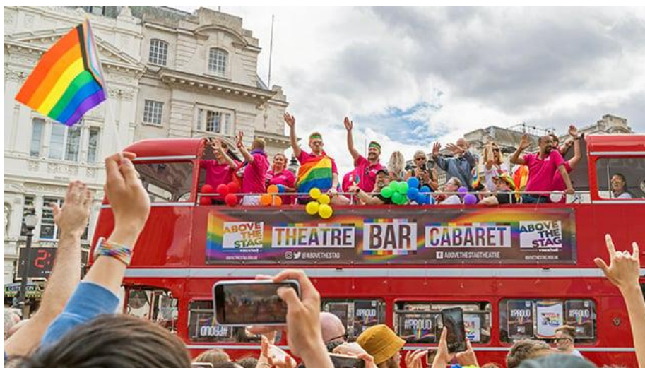
Celebrate London Pride.