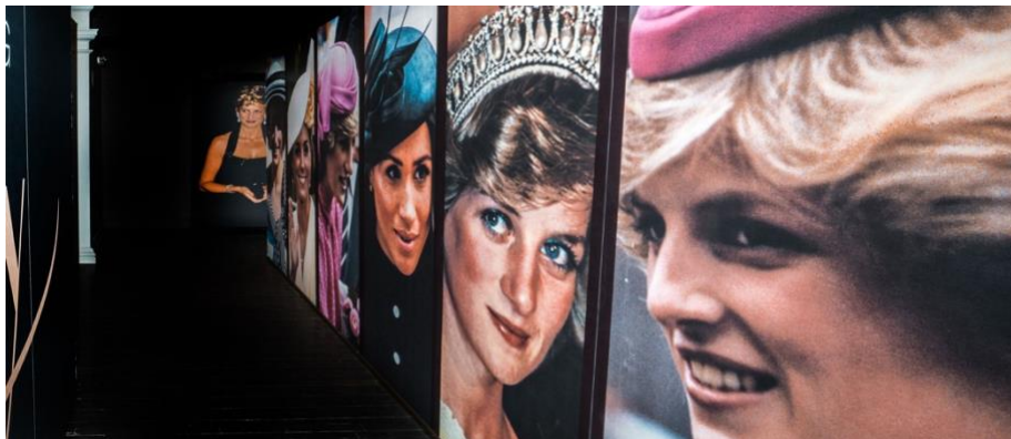
Discover never-seen-before images of Princess Diana and her family at Dockside Vaults.