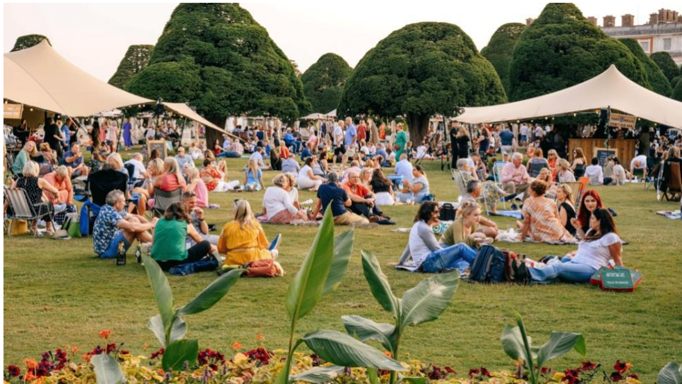
Crowds picnic in the gardens during the Hampton Court Palace Festival.