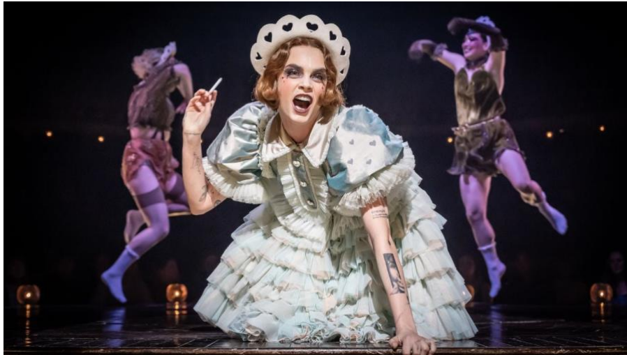
Don't miss Cara Delevingne in CABARET at the Kit Kat Club.