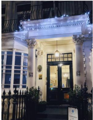
Hotel 63 Bayswater Road

Bookings continue to mainly come from the booking.com platform. The market in London reveals that bookings are made around the three-month mark before arrival. This can mean that rooms are not available for that last-minute weekend you want to plan. Please contact the hotel directly in that case, as rooms may have been made available even though it shows booked out via booking.com. If you are looking to book a room, go to the website https://hotel63.co.uk and make a direct booking to get the best rate available