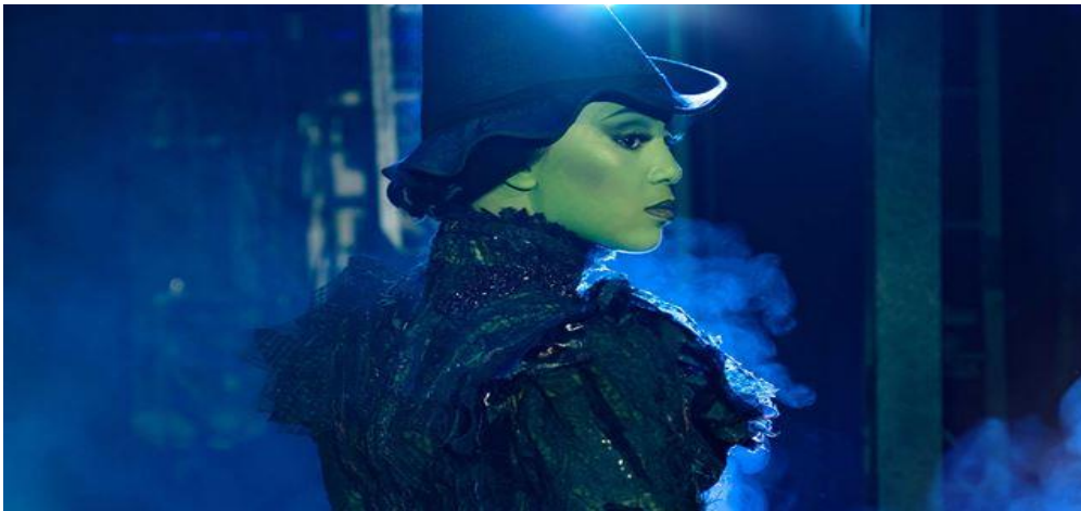
Travel to the world of Oz and discover the story of the unlikely friendship between two witches: Glinda and Elphaba, with Wicked The Musical.