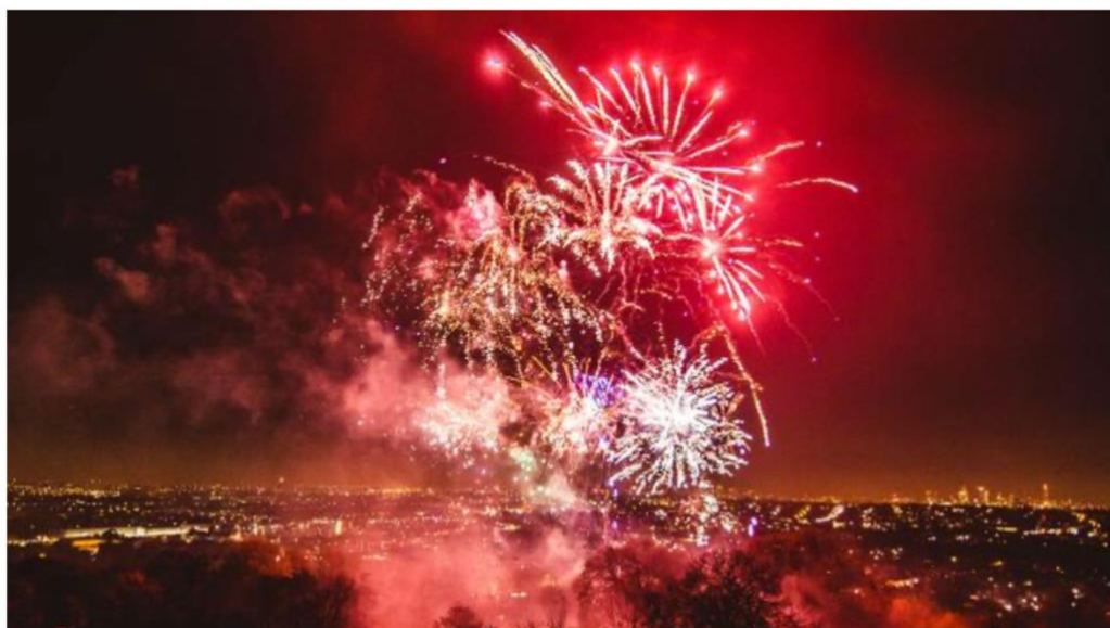
Fireworks Festival at Alexandra Palace.