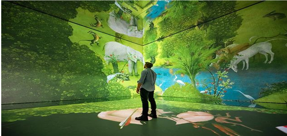
The Garden of Earthly Delights at Frameless, an immersive exhibition in London.