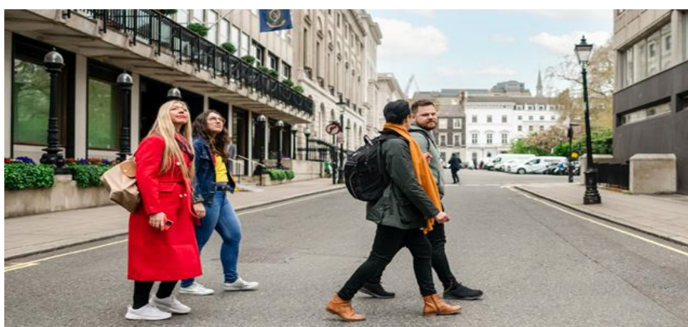
Learn about the history of London on a walking tour.