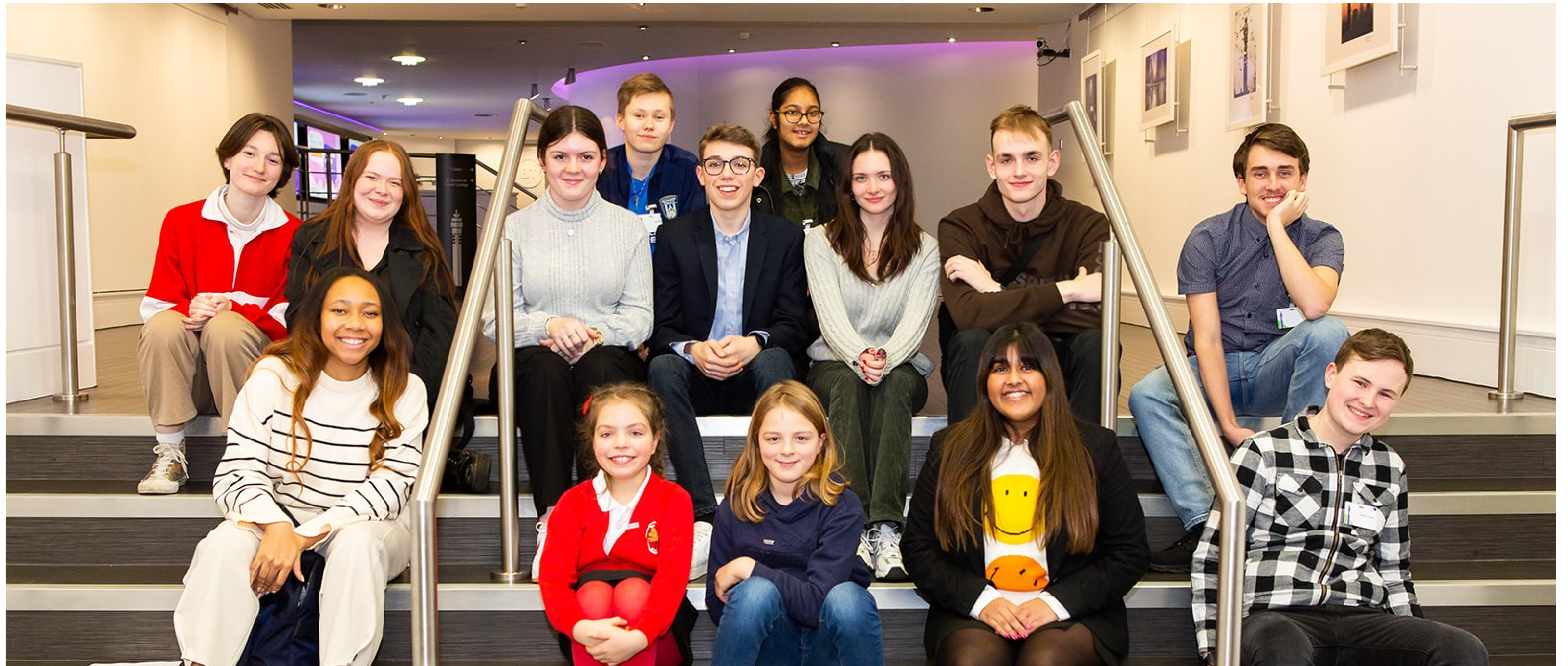
Safer Internet Day 2023 Youth Speakers!