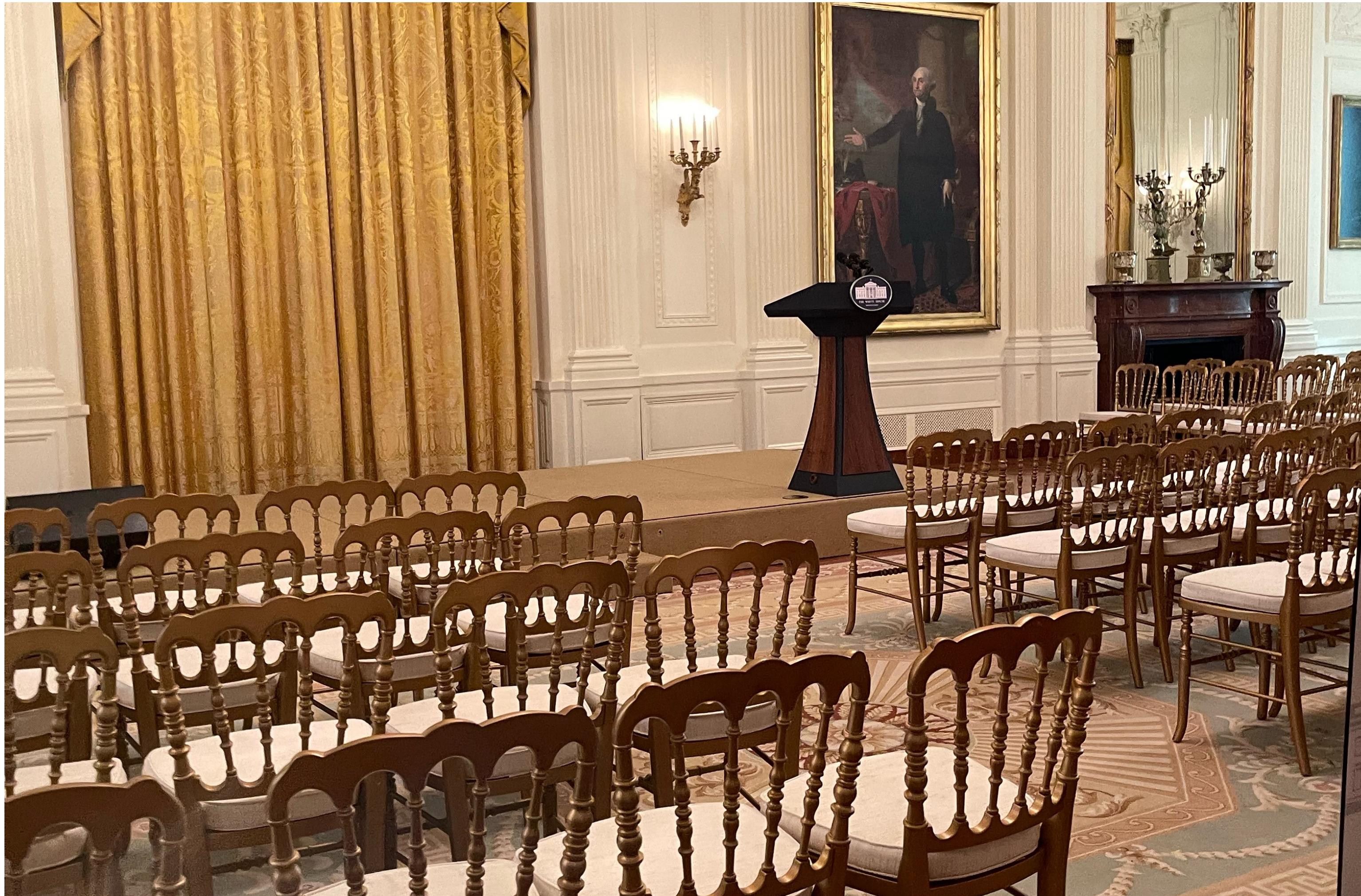
White House Gender Policy LEAD Initiative