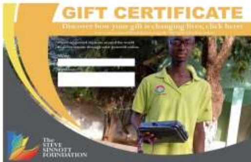
The Gift of Solar Radios