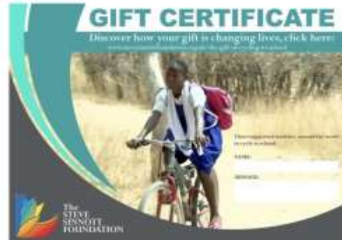
The Gift of Cycling to School