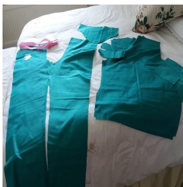
Cut and waiting to be sewn