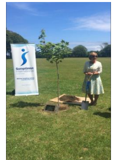
Lady Corder tree planting