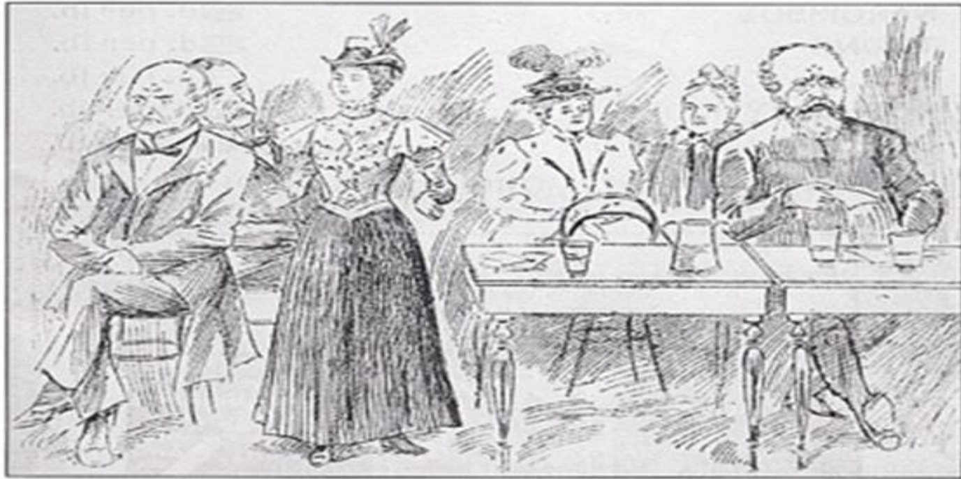
Cartoon showing Bondfield addressing a NAUSAWC recruitment meeting, July 1898