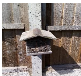
Bee Box in Garden

SI Burton upon Trent and District's original project for 2020 was climate change and we have been able to pursue this project during lockdown.