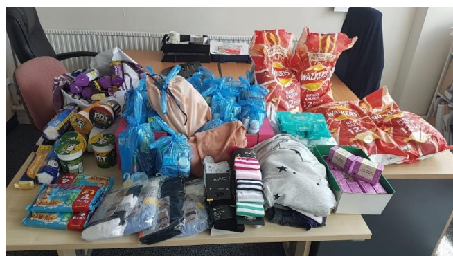
Photo shows goods collected for Changing Lives

Members met at Linden House respecting socially distanced rules and donated food for Di's Kitchen.