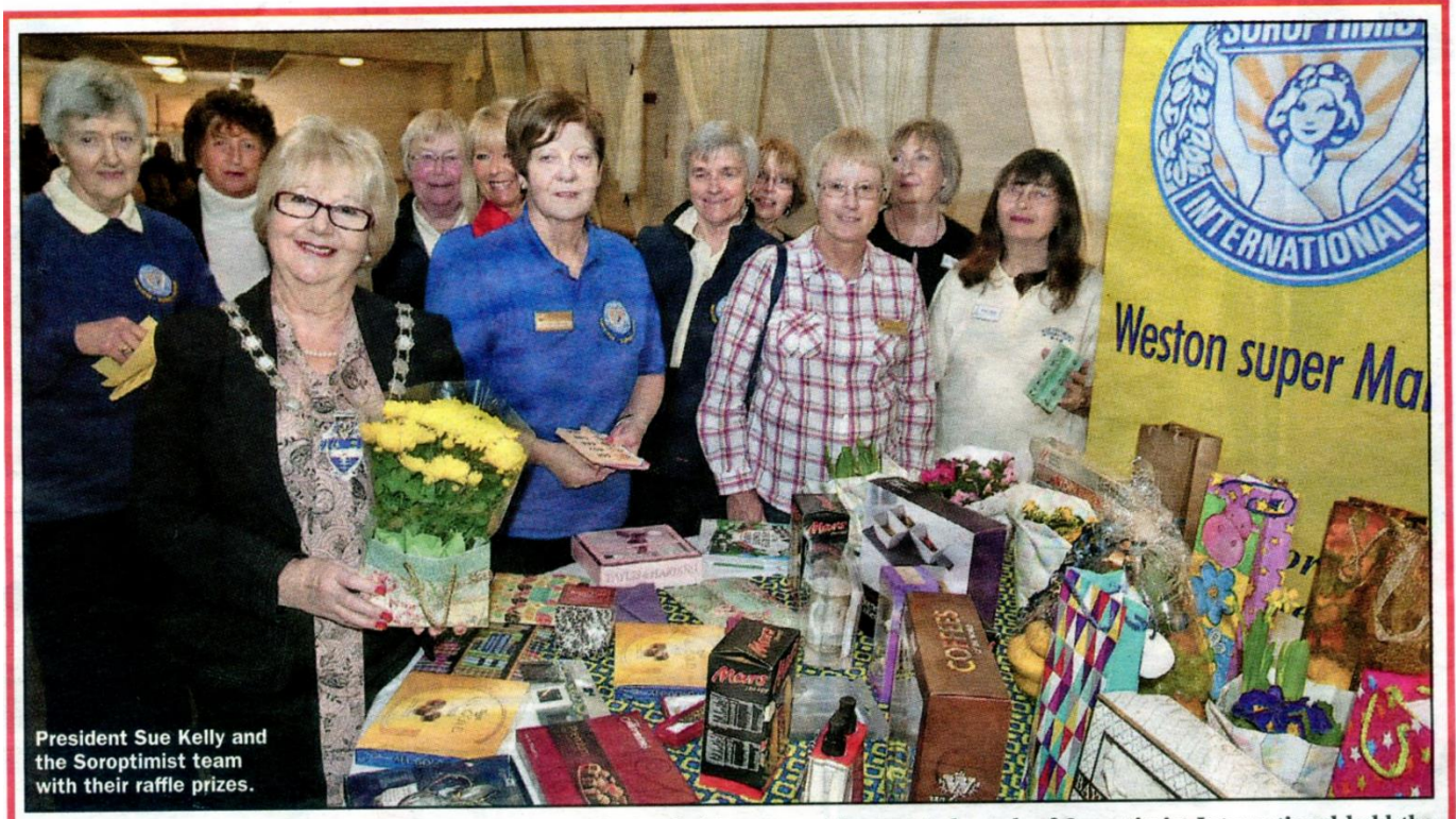
■ GENEROUS women turned clothes into cash at a charity fashion show. The town's branch of Soroptimist International held the event at Weston Football Club in Winterstoke Road. The catwalk show was followed by a sale and a raffle, with proceeds going to help vulnerable women and girls.