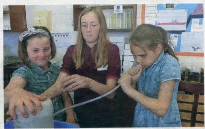
■ The girls took part in a number of experiments.

A spokesman for the organisation said: "Teachers have been