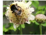
WILD ABOUT WHITSTABLE, MONDAY AUGUST 12TH TO SUNDAY AUGUST 18TH 2024