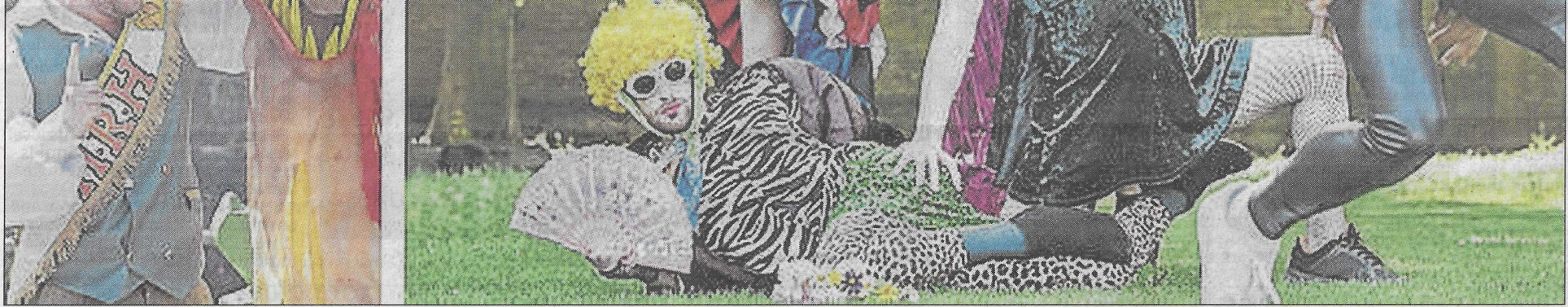
Some of the performers who will be at the Hat Fair this year