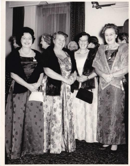
Impressive fashions of the time