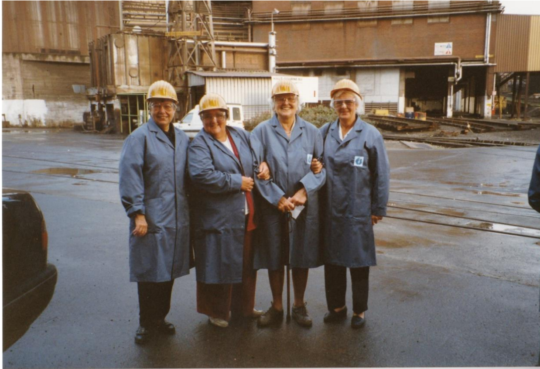
An impressive engineering look to the visit to Charleroi