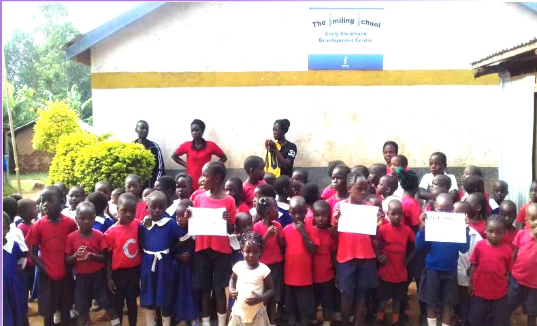
Early learning Centre in Kenya