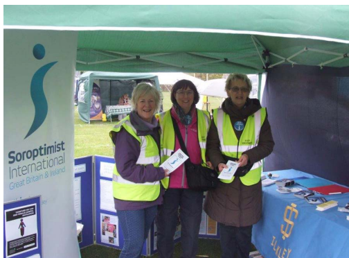
Ilkley at the Carnival tent.