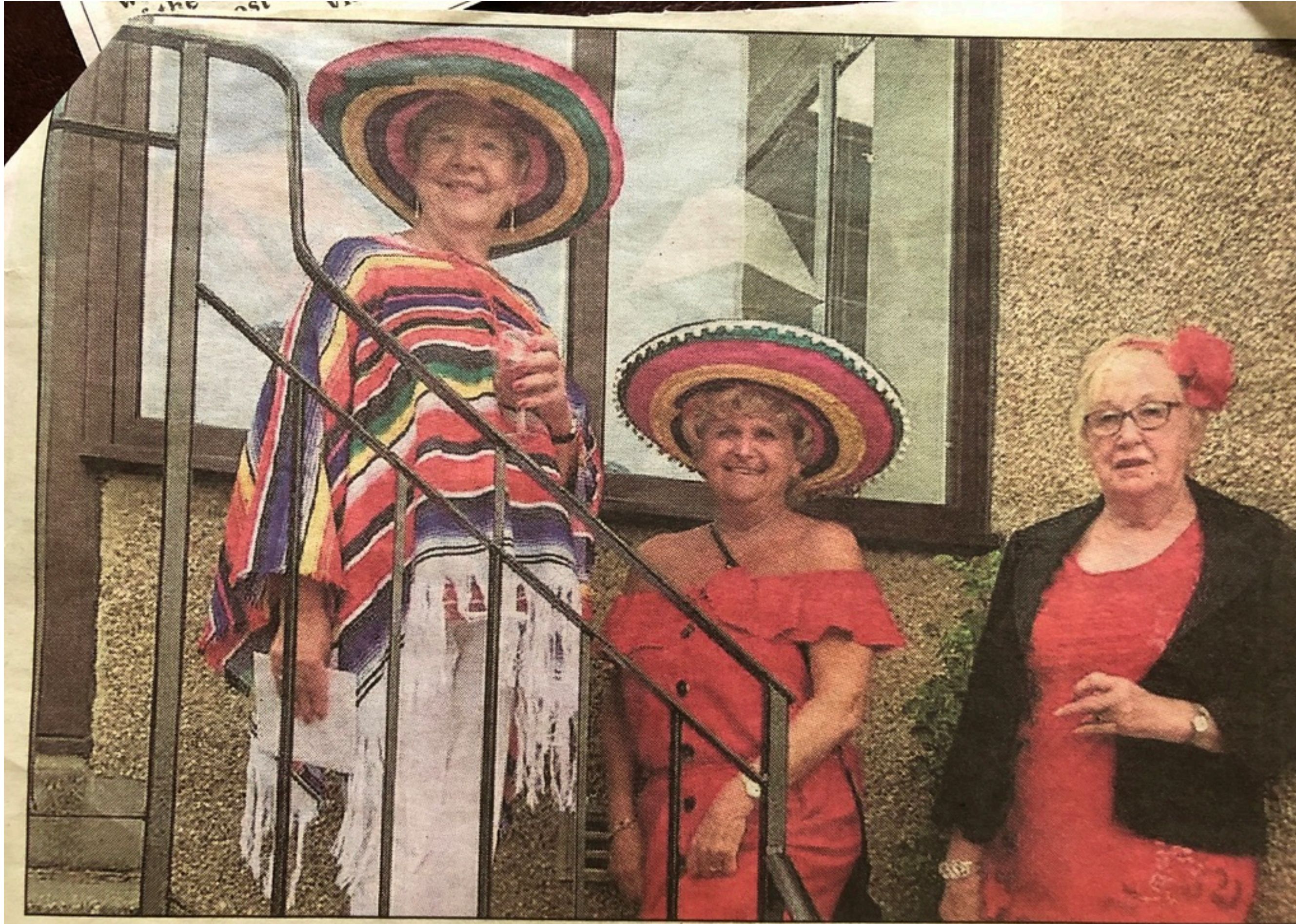
Some of the Skipton Soroptimists enjoying a tapas and sangria evening as a charity fundraiser

Over the last 18 months we raised money through: strawberry teas at a members' home, a Tapas and Sangria evening, pie and peas and quiz evenings, petal drives, Carols in the Castle and a Gala Concert.